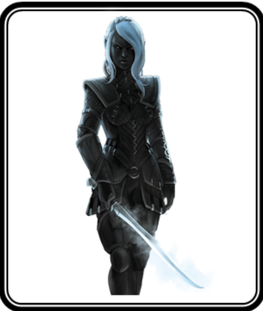
Kayleth Tor'Erhyl (kay-leth tor-ay-hill) Sword Dancer

Kayleth Tor'Erhyl (kay-leth-tor-ay-hill) – Drow Female Sword Dancer of Ellistraee Personality: Kayleth is a high-ranking member of the House Tor'Erhyl. Extremely independent, Kayleth was chosen as the one to make contact with the surface to prevent the most recent slave-taking raid. While graceful and acrobatic in combat, Kayleth is often direct and serious when she speaks. Ideal: Freedom. Chains are meant to be broken, as are those who would forge them. Bond: I fight for those who cannot fight for themselves. Flaw: Once I pick a goal, I become obsessed with it to the detriment of everything else in my life.