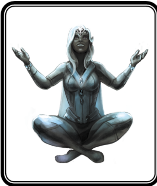
Meriele Tor'Erhyl (merry-elle tor-ay-hill) Matron of House Tor'Erhyl

Matron Meriele Tor'Erhyl (Merry-elle-tor-ay-hill) Drow Female, Matron of House Tor'Erhyl Personality: Meriele Tor'Erhyl looks youthful (early 20s in human terms) but is over 200 years old. Typically, she smiles brightly and speaks excitedly. Her mannerisms mask a cunning and calculating mind and though the deception is not entirely malicious, neither is it incidental. Ideal: Change. We must help bring to life Ellistraee's vision for our people. Bond: I fight for those who cannot fight for themselves. Flaw: Responsibility weighs heavily upon me and avoid forming deep bonds because of it.